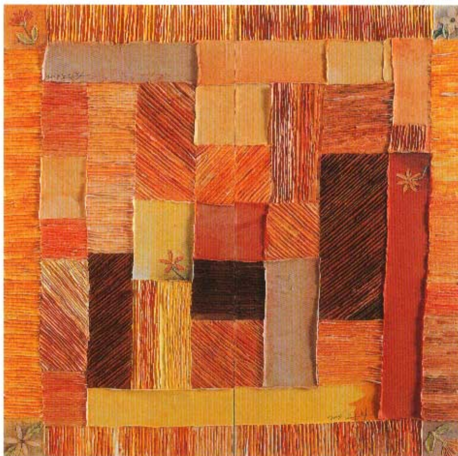
Old fragrance 2004-3.4 / Yellow earth, Korean paper, ink Dye 80×80cm