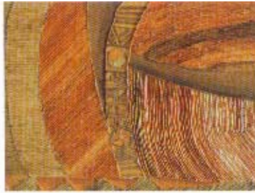
Yellow earth yearning 2004-2 Yellow earth, Korean paper, Korean ink, Dye 70×50cm