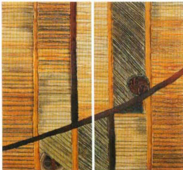
Old fragrance 2004-5

Yellow earth, Korean paper, Korean ink, Dye 40×80cm