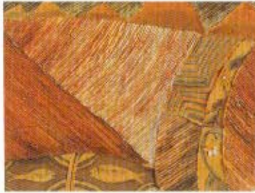
Yellow earth yearning 2004-3 Yellow earth, Korean paper, Korean ink, Dye 70×50cm