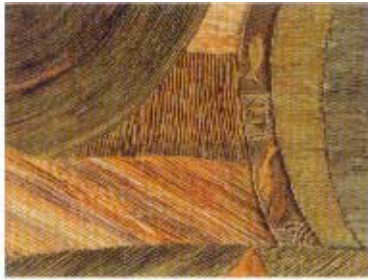
Yellow earth yearning 2004-1 Yellow earth, Korean paper, Korean ink, Dye 70×50cm