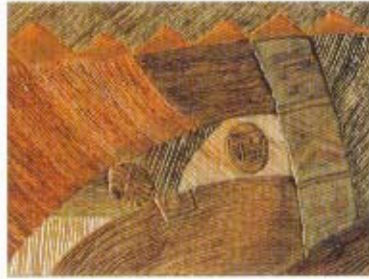
Yellow earth yearning 2004-4 Yellow earth, Korean paper, Korean ink, Dye 70×50cm