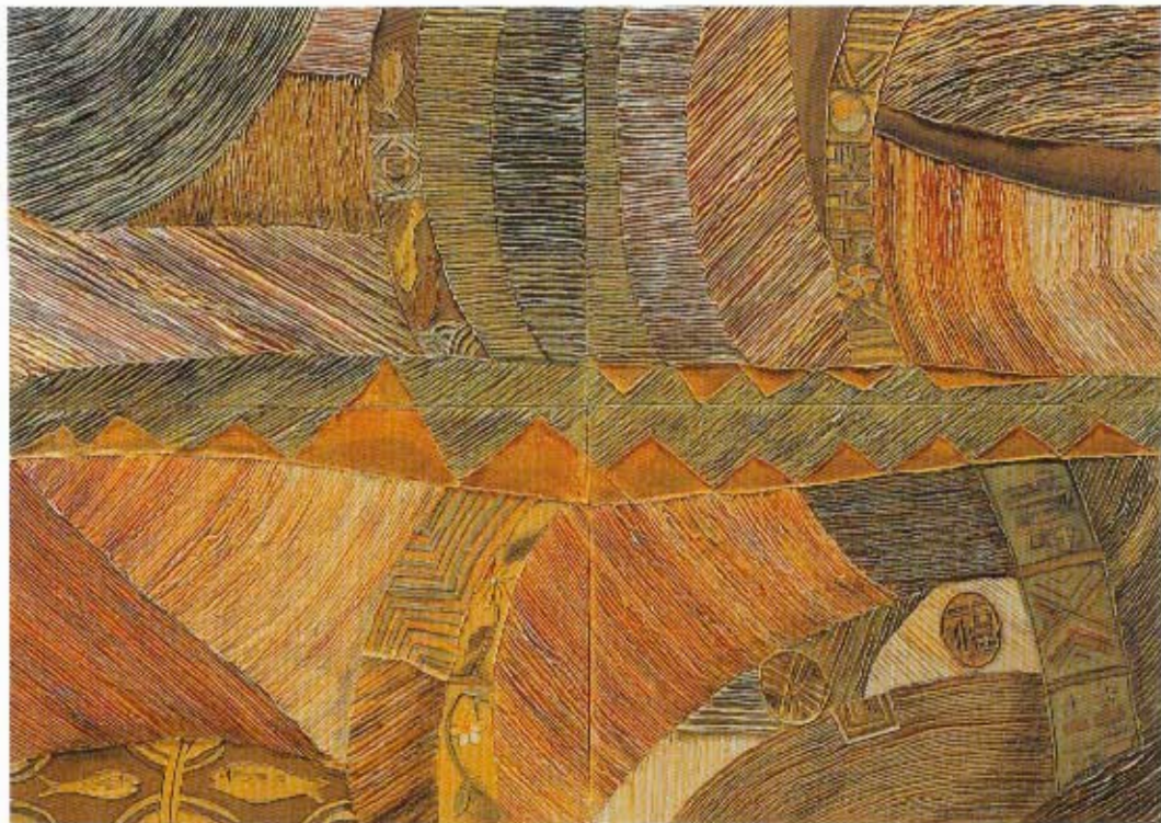
Yellow earth yearning 2004-1,2,3,4 Yellow earth, Korean paper, Korean ink, Dye 140×100cm