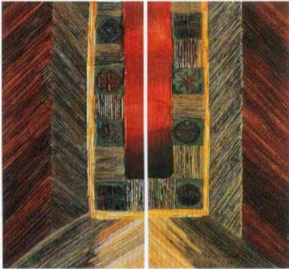
Old fragrance 2004-1

Yellow earth, Korean paper, Korean ink, Dye 40×80cm